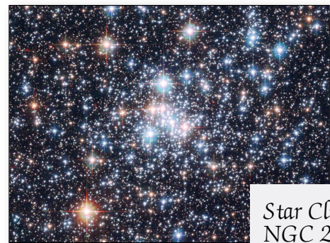
Star Cluster NGC 290

Throughout history, many have doubted that Jesus fashioned all that we see and hear around us. 2 Due to our fallen state, a study of nature alone cannot prove Christ's creative